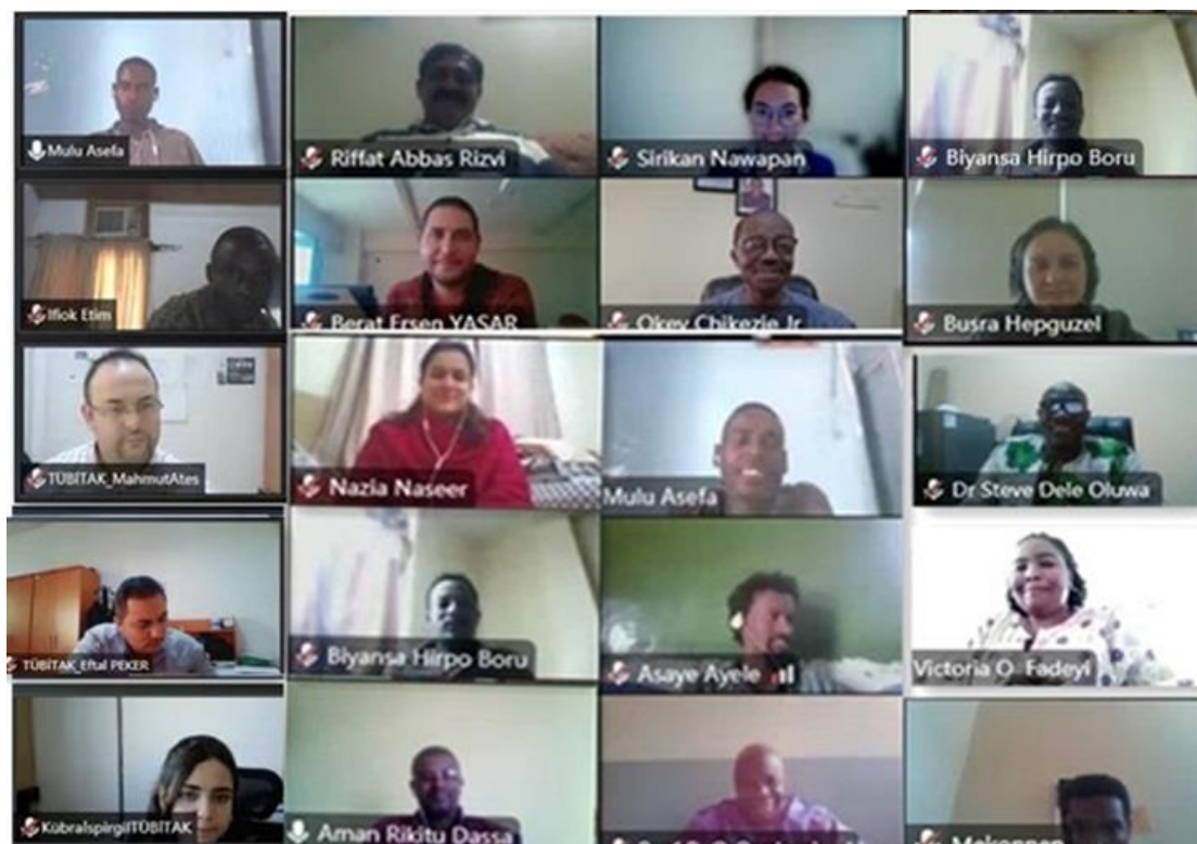
Fig. 1 Group photo of some participants online