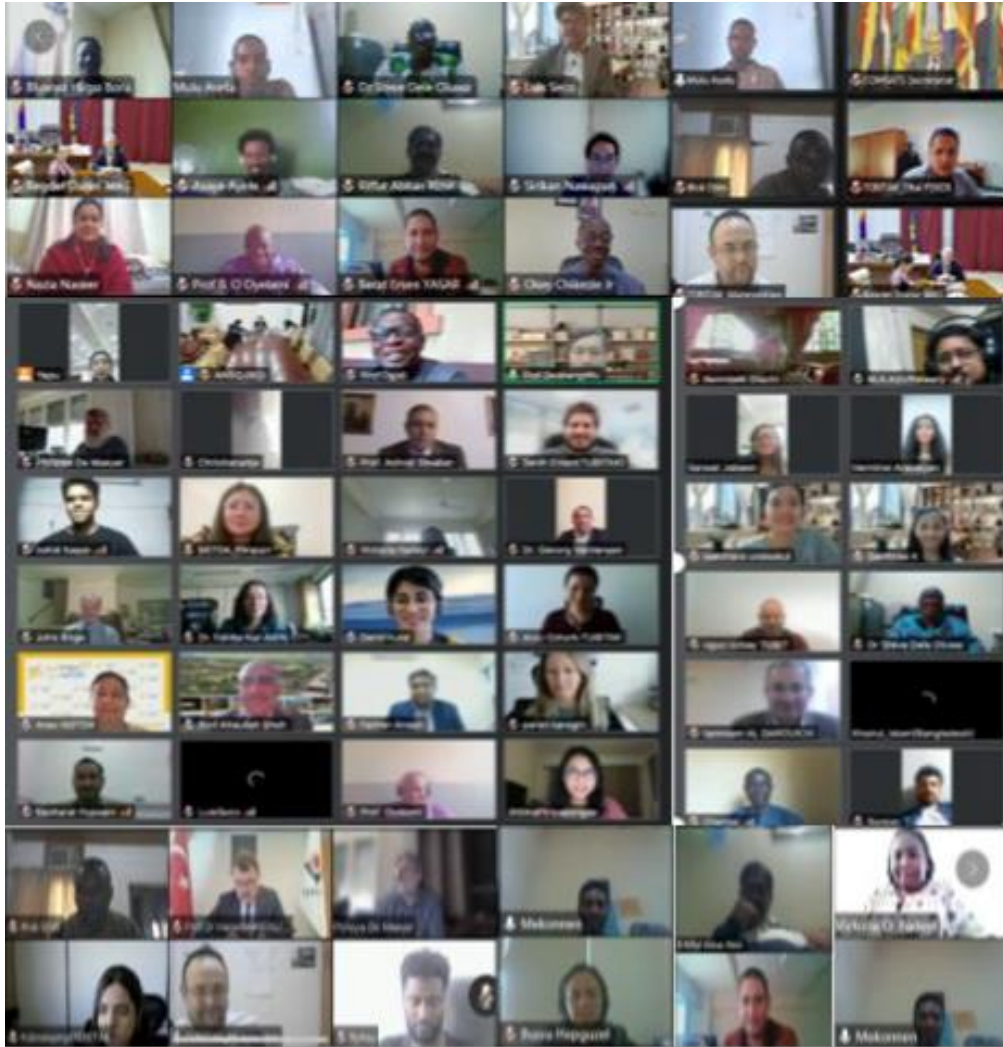
Figure 1 Group photo of members online