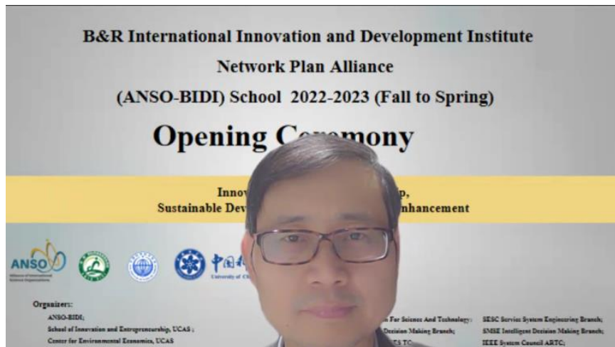
Figure 2 Professor Wu Desheng

organizations to conduct extensive exchanges and cooperation through the global network of think tanks and seize new opportunities for common development.