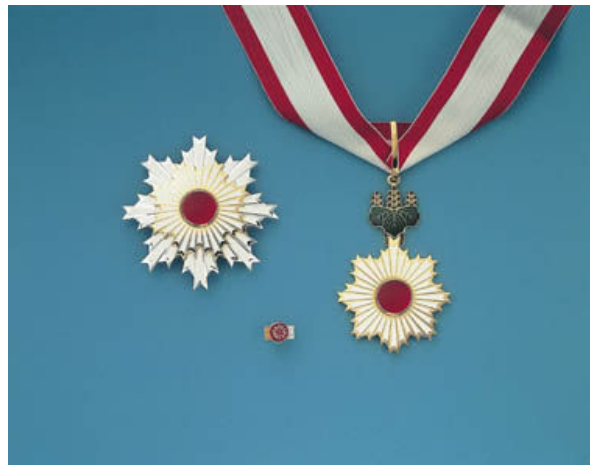
The Order of the Rising Sun, Gold and Silver Star