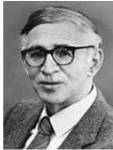
Sir Aaron Klug