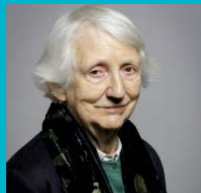
Baroness Onora O'Neill MAE FBA FRS

Professor of Medical Ethics University of Lund