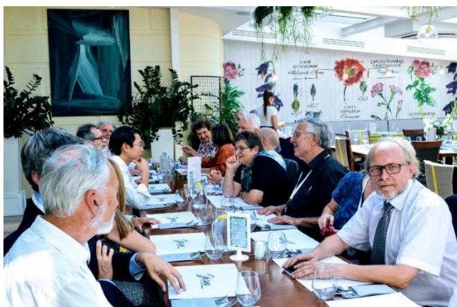
One of the pleasant luncheon breaks amongst the lovely surroundings and delicious dishes served at Jasna restaurant, on Wroclaw’s riverside front.