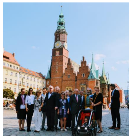
Until next time in Wroclaw!