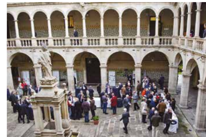
Academia Europaea's 30th Annual Conference in Barcelona. MAEs networking in the IEC cloister