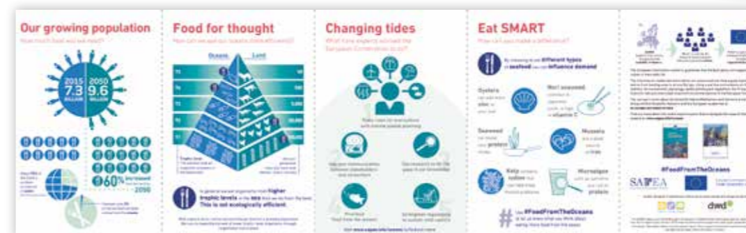
Infographics created to engage the public